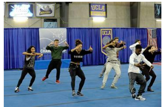
The Soul Flow dance crew rehearse a dance number for the movie.