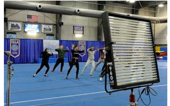
The Soul Flow dance crew rehearse a dance number for the movie.